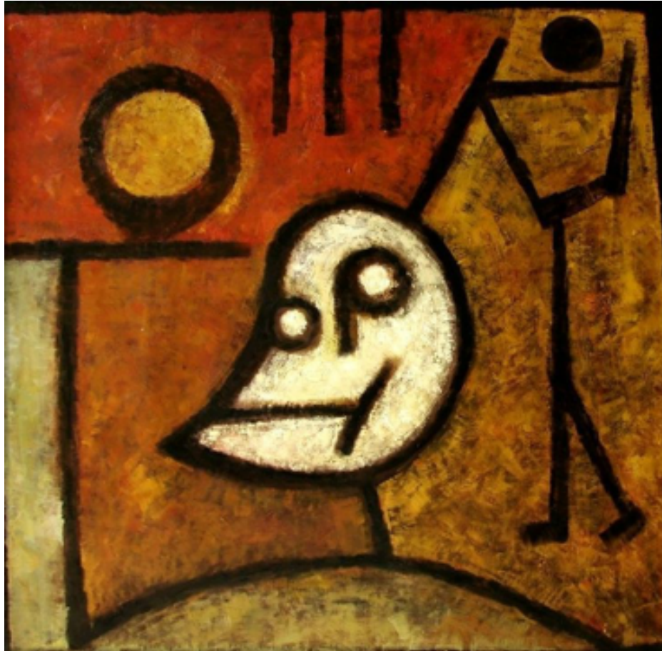
Paul Klee, Death & Fire 1940

The German word for death is Tod, which can be seen throughout the work. It was one of the last paintings he did before he died.