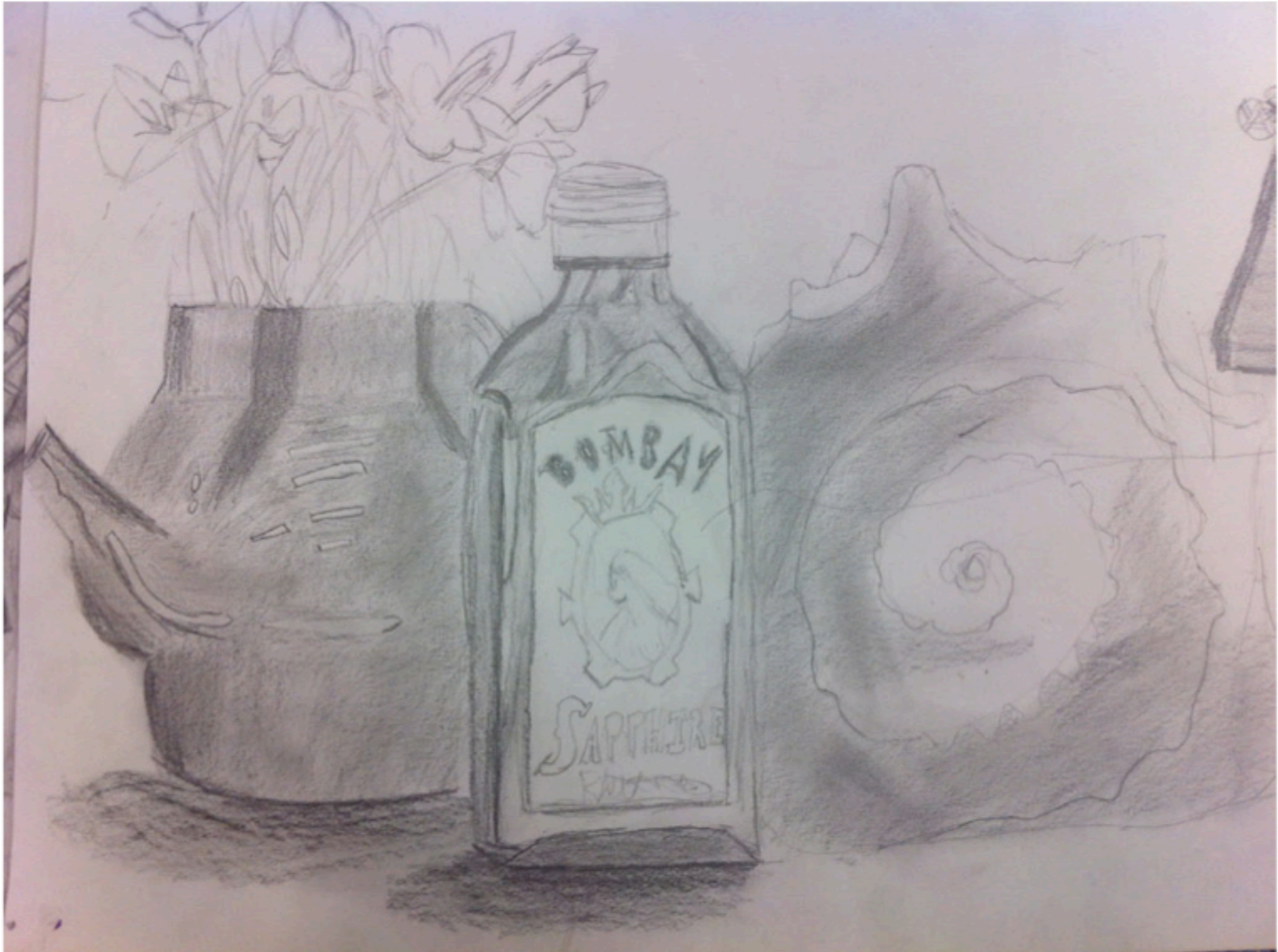
IN6 (Darker tones needed, shading incomplete)