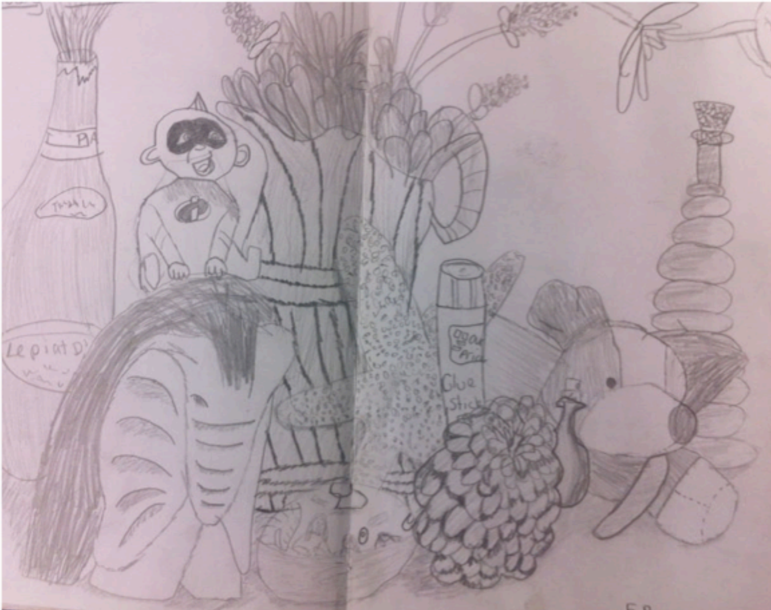
IN6 (Shading incomplete, some measuring wrong)